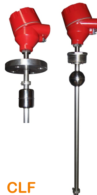
CLF Series Level