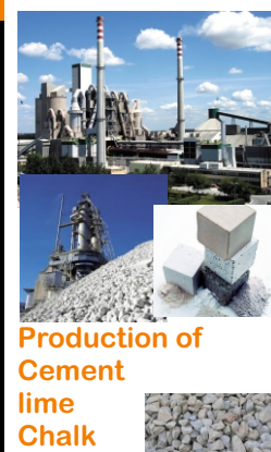
Production of Cement lime Chalk