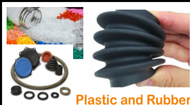
Plastic and Rubber