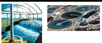
Acqueducts & Purifiers