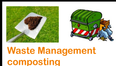
Waste Management composting