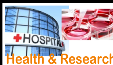
Health & Research