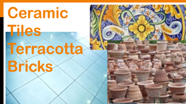
Ceramic Tiles Terracotta Bricks