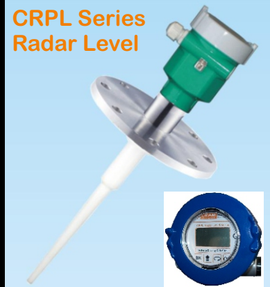
CRPL Series Radar Level

Real Company - Customer Support Concrete - Certified Quality Production & Quick Delivery with FDS Fast Delivery Service - Delivery in 24-48H All Over the World