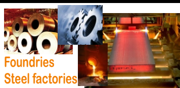
Foundries Steel factories Mechanical Industries