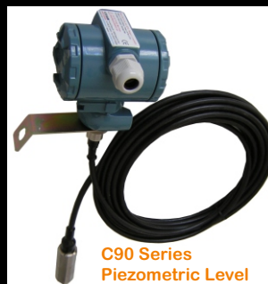
C90 Series Piezometric Level